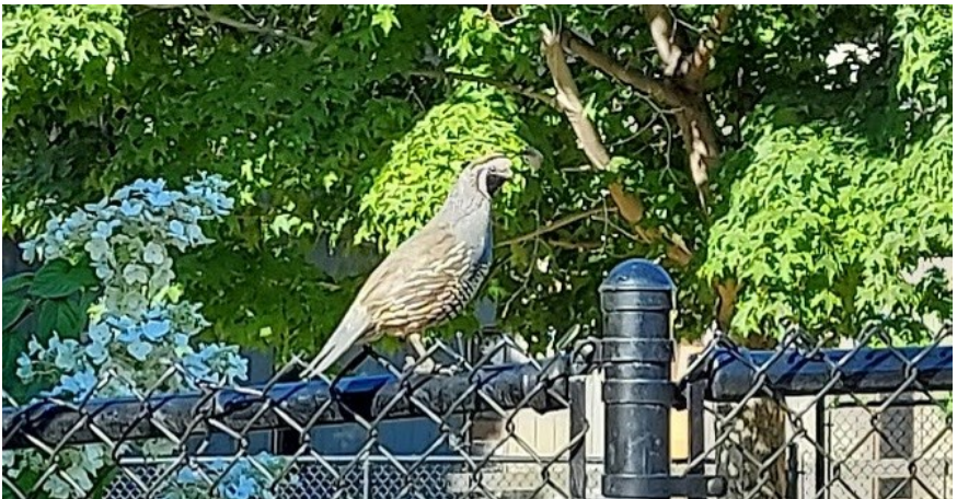
A quail came to perch on the church fence.