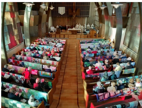
The Diecemakers continue to make the lovely quilts for Quilt Sunday in November.