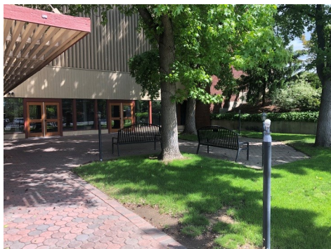
Dorothy Brink rakes and cleans the courtyard.