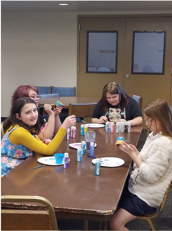
Wednesday Youth painted pots for Earth Day.