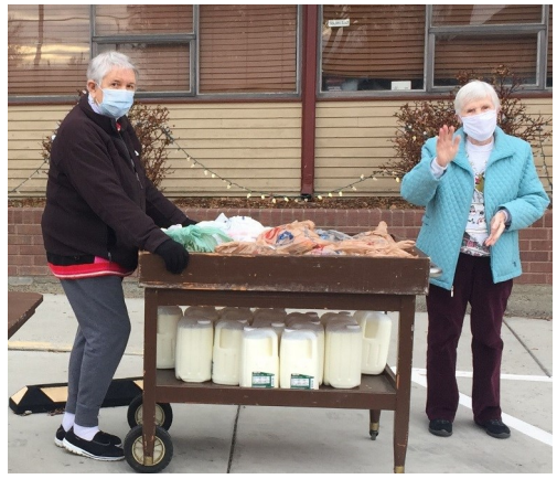
Representing the 80+ year olds.