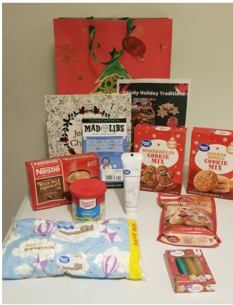
Family Activity Gift Bag